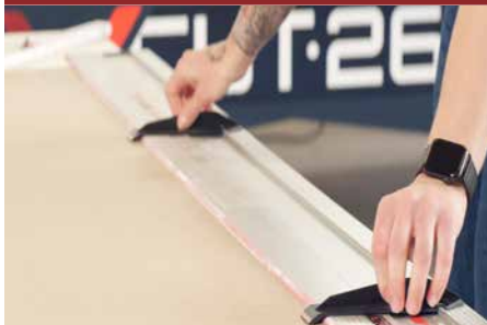
Precise positioning of guide rails