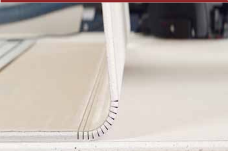
Up to 4 cuts in a single pass