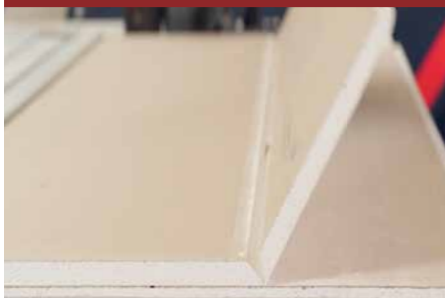
V-shaped grooves for folding/bending technology (90° + 45°)