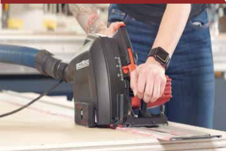
Cutting and sawing depth up to 26 mm