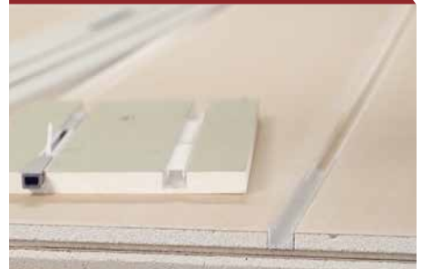
Rectangular grooves for LED profiles (15 - 25 mm wide)